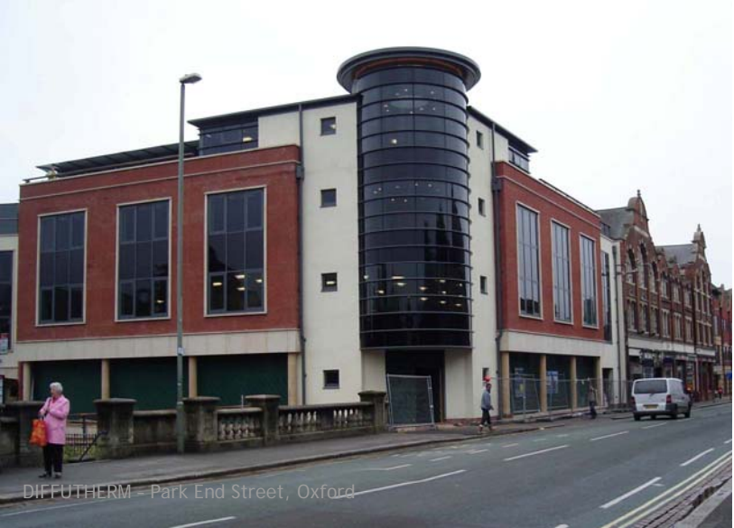
DIFFUTHERM – Park End Street, Oxford